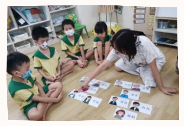
*Chinese Version available in the Appendix

Children will learn musical expression through a variety of creative means which include musical games, appreciation of classical music as well as catchy rhymes.